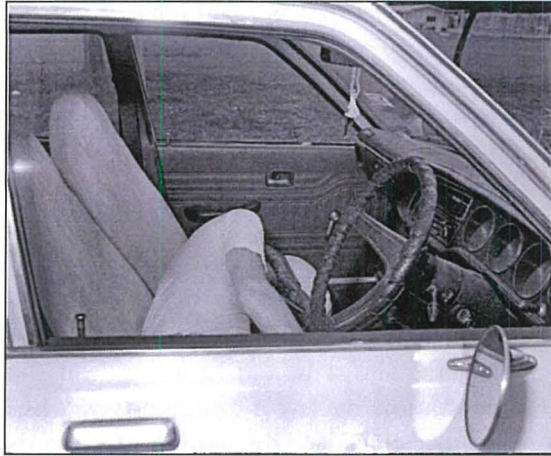
Figure 5 - IS Image #003 (cropped) (refer Attachment R)