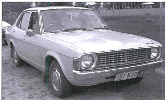
Figure 7 - IS Image #001 (cropped) (refer Attachment R)