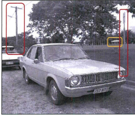
Figure 1 - IS Image #001 (14 October 1983) (refer Attachment R)