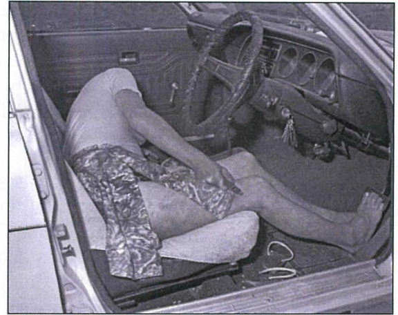
Figure 6 - IS Image #005 (cropped) (refer Attachment R)