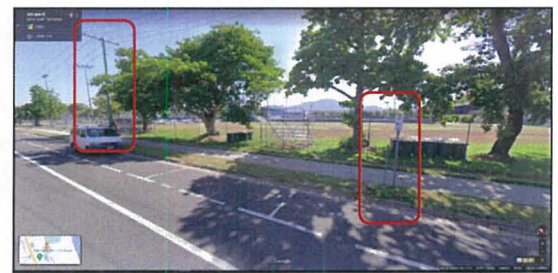
Figure 4 - IS circa 2019 (refer Attachment V)

NB: Figures are indicative only, as the power poles and street signs depicted have been replaced (Map data © 2021 Google).