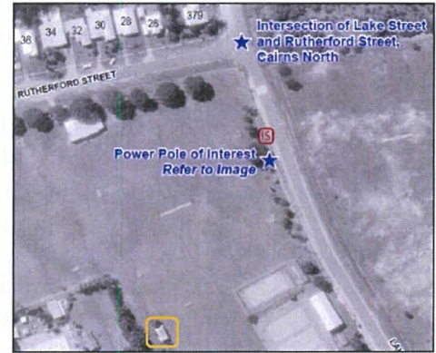
Figure 2 - IS vicinity circa 1983 (refer Attachment S)